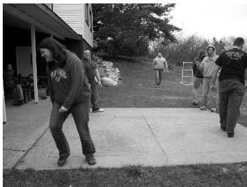
Retreat-goers playing an intense game of 4-Square